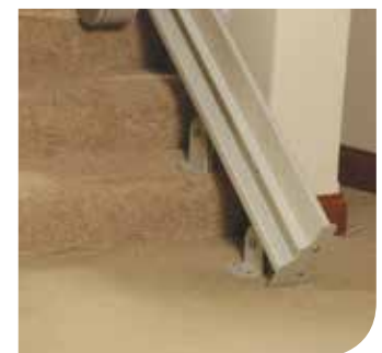
Powder-coated champagne painted rail.