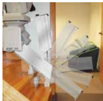
Power or manual folding rails for narrow hallway or when doorway is at the bottom of stairs. Manual operation or push button automatic.